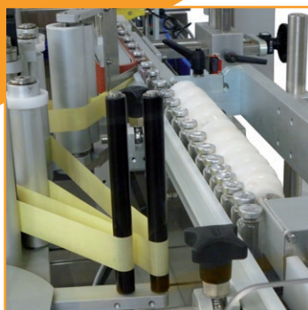
Worm screw separator