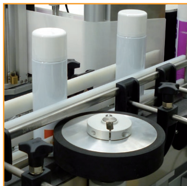
Spacer by motorized wheel