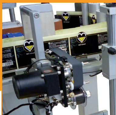
Hot foil coding unit

LABELX JR 140 EW Start photocell Conveying module with flat belt Wrap around device COMPACT main frame Horizontal and vertical microregulation unit